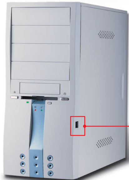
TK-5200 (Blue A-658)