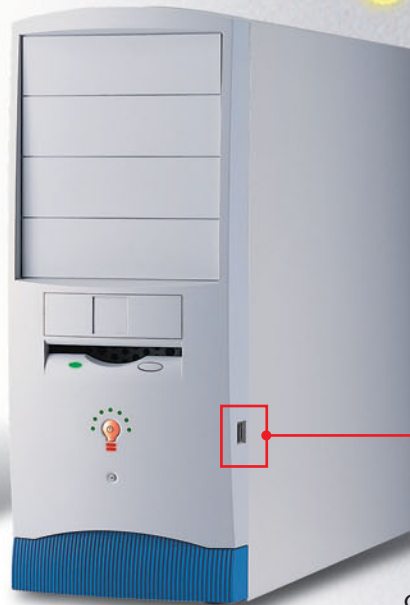
TK-5300 (Blue A-285)