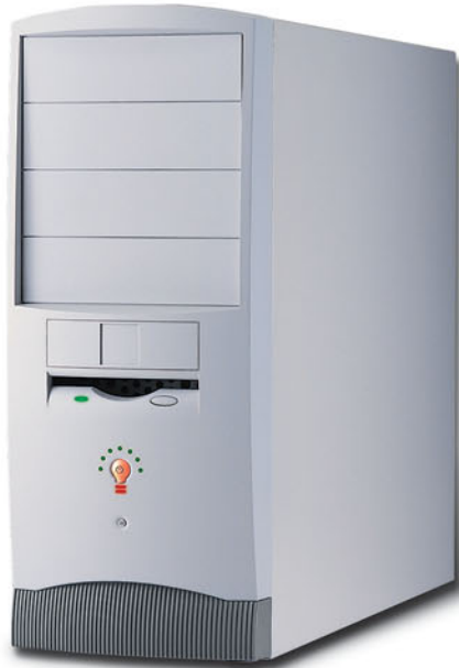
TK-5300 (Grey A-431)

3-in-1 Midi-Tower Case Meet Intel® P4 Specifications