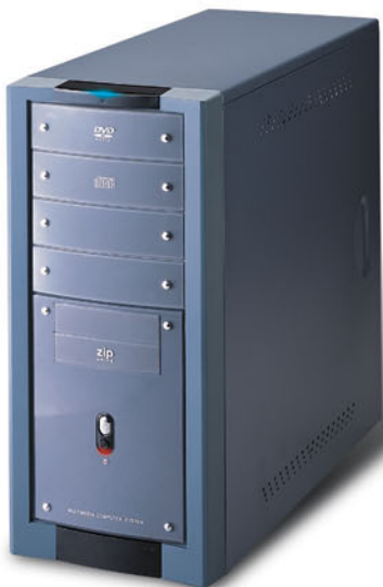
Color No.: A03 (Metal-Blue)

• THE OPTIONAL CRYSTAL COLORS WITH ELABORATE MIRROR TREATMENT