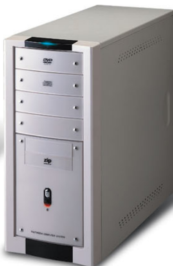
Color No.: A02 (Pearl-White)