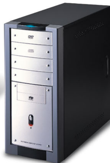
Color No.: A01 (Silver-Black)