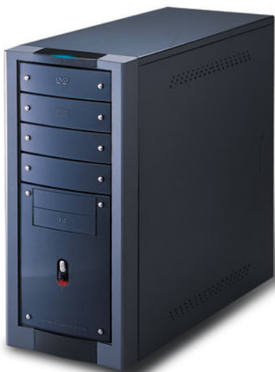
Color No.: A04 (Diamond-Black)