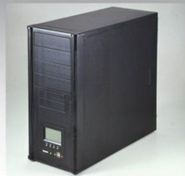
TK-G500 A-01 (Black color)