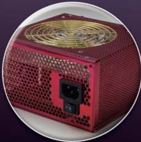
● Mesh PSU in Red