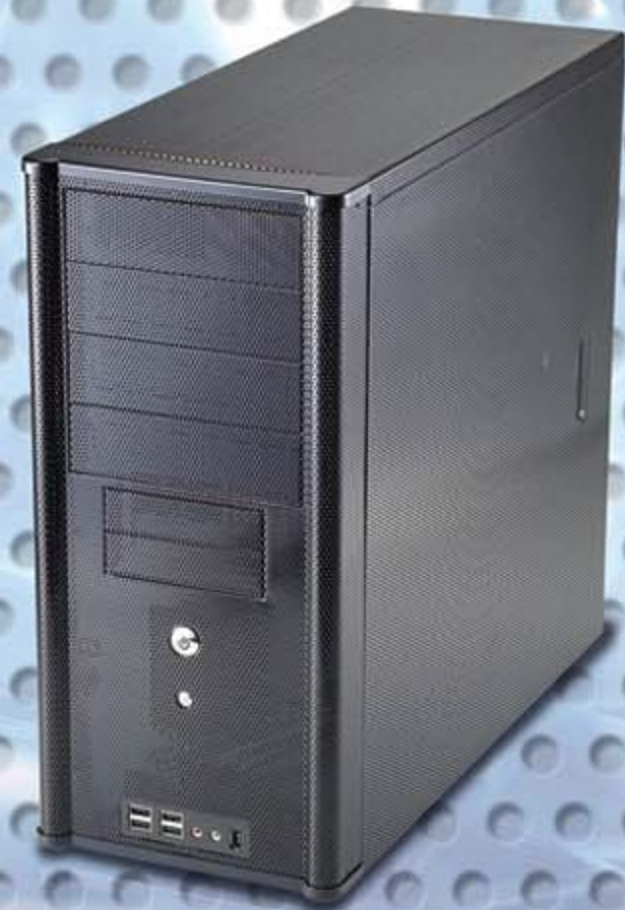
● TK-G501 (A-03) Plated in Black