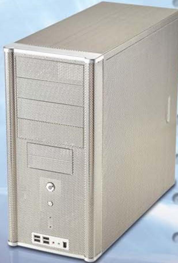
● TK-G501 (A-02) Plated in Silver