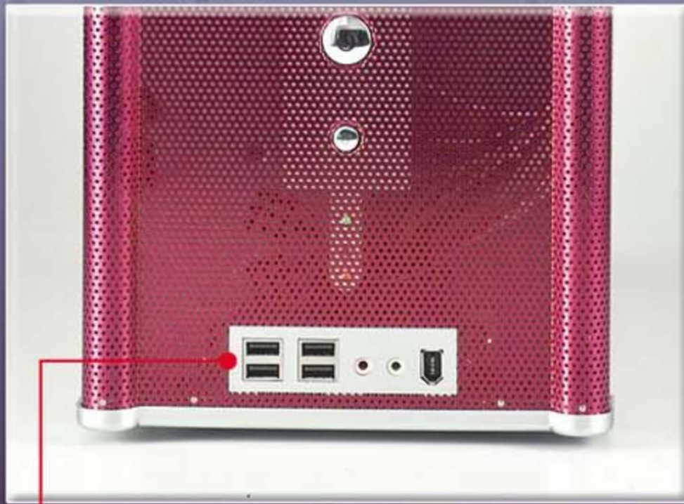
● The Front Expansion Ports for USB (4 ports), Audio & IEEE1394.