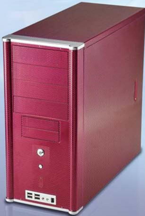
● TK-G501 (A-01) Plated in Red

Thermally Advantaged Design ATX Case Approved By Intel® P4