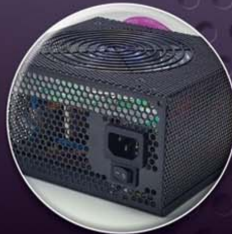
● Mesh PSU in Black