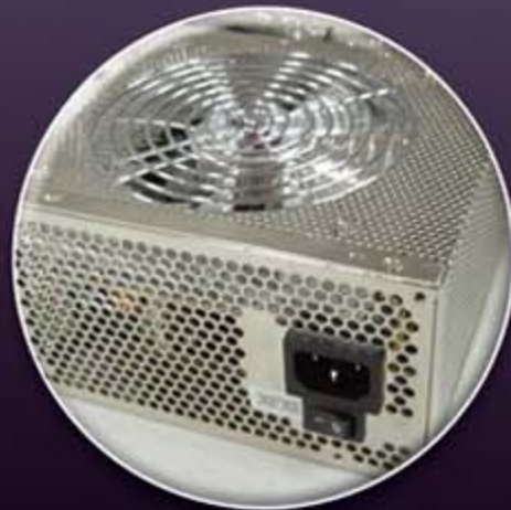
● Mesh PSU in Silver